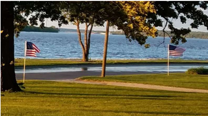
Flags flying along the Mississippi River in Moline