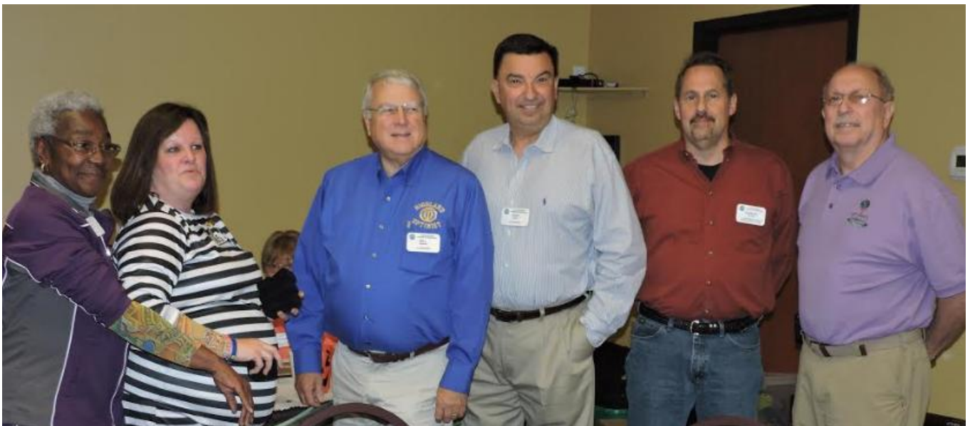
Members of the 2016-17 Optimist Leadership team, getting ready to start a wonderful year!