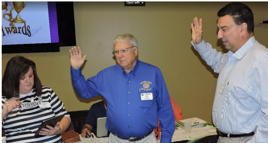
Governor Ruth Del Re swearing in two new Lt. Governors