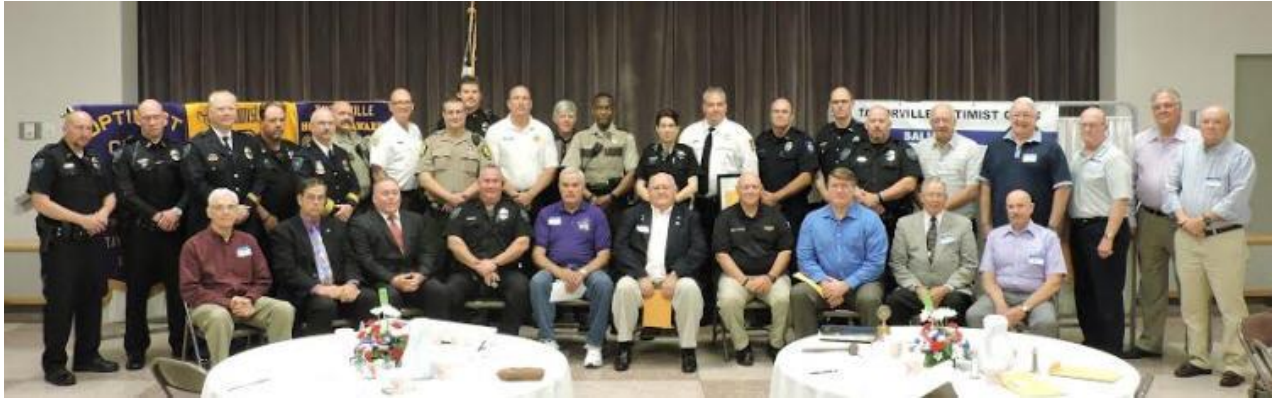
Assembled group of local, county, and state officers, active and retired.

As a part of "Respect for Law" month, the Taylorville Optimist Club held a "Salute to Law Enforcement". Approximately 80 people attended the breakfast which paid tribute to law enforcement officers from all around Christian County.