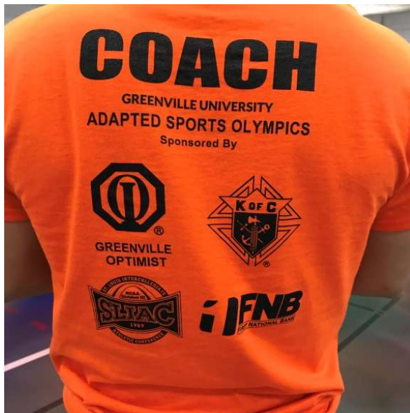
T-shirt worn by coaches and participants in the Greenville University Adapted Sports Olympics