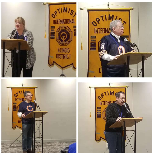
Just a few of the Optimist members sharing their clubs' successes during the Club Brag session.