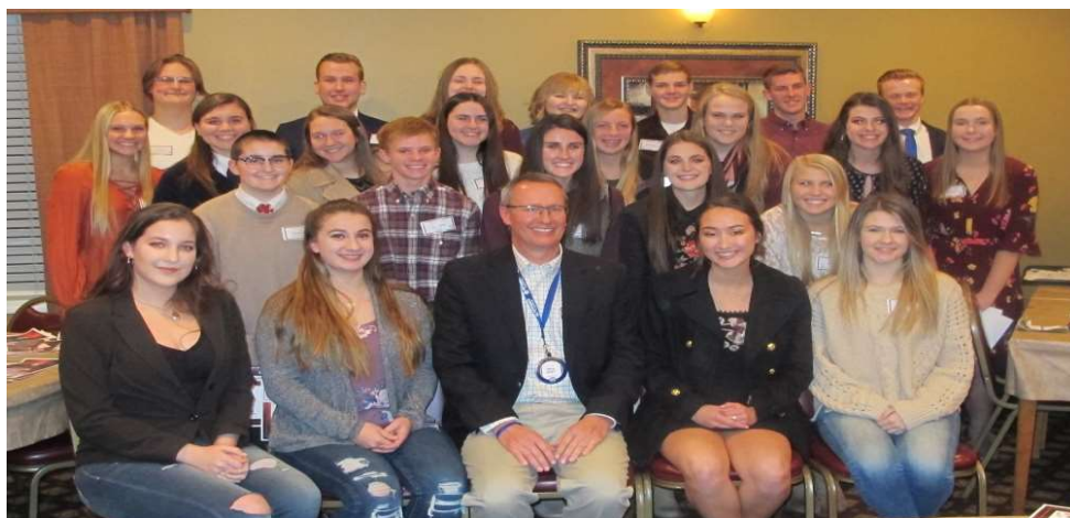
Highland Optimist Club President with Youth Leaders of Highland High School