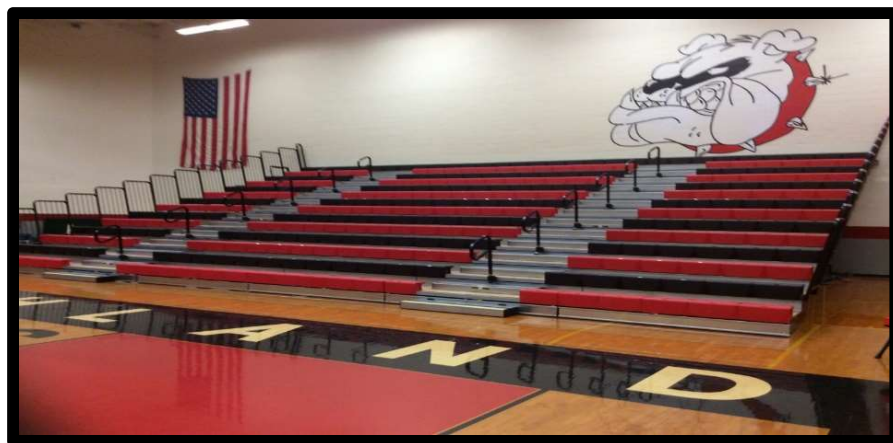
These pictures show additional new bleachers (approx. 400 seats) and new chair seating for the Highland High School Gymnasium which were purchased by the Highland Optimist Club this year and donated to the school.