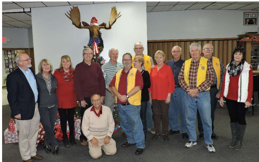
Assembled group of Santa's helpers

The Taylorville Optimist Club hosted several children and their families for the annual Christmas for Kids just before Christmas. The evening consisted of food, carols, and a visit from everyone's favorite guest, Santa Claus. Every child received a gift from the jolly Saint Nick before he had to leave to help prepare for his big night on Christmas Eve.