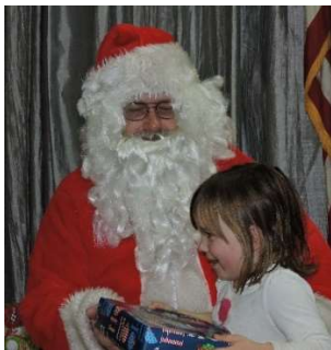
Santa brings big smile