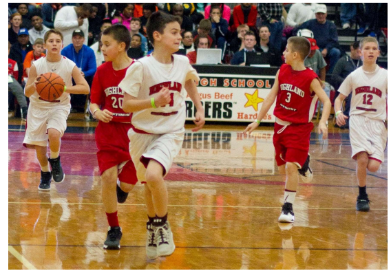
Highland Optimists donate $4,000 annually to 4 th , 5 th , and 6 th grade Basketball Rec Leagues.