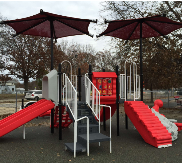
The Highland Optimist Club donated $6,000 to a new Early Childhood and Pre-K playground structure at the Highland Primary School in 2016.