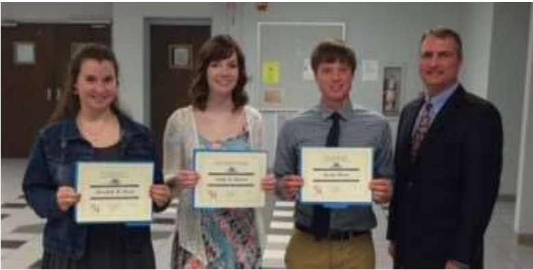
Highland Optimists donate $8,000 annually to college scholarships.