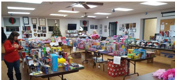
Freeburg Township Hall set up for the families to select toys, arranged by both age and gender

The Freeburg Optimist Club's annual Toys for Tots Christmas toy drive and distribution was a huge success. The club gave a variety of toys and gift certificates to more than 95 children in the community.