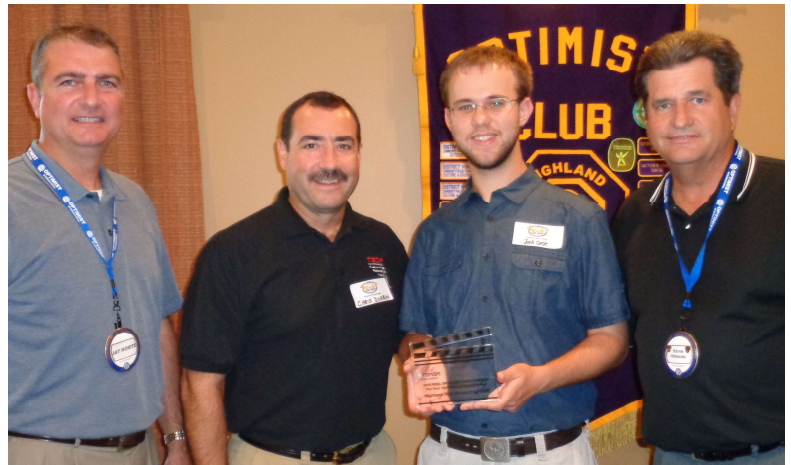
Highland Optimists donated to the Highland High Tech Club this past year. In addition, the Highland Optimist Club donates over $18,000 annually to more than 20 other organizations in the Highland community through matching grants and annual budgeted donations.